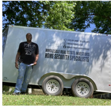
S & R Investments Properties LLC received a full funded loan