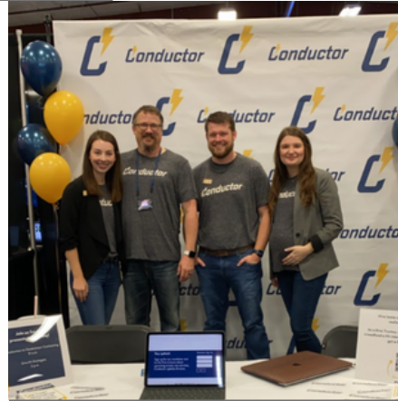
Conway Business Expo