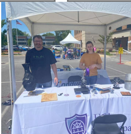
Toad Suck Daze Tinkerfest

Innovation Sprints & Strategic Planning Sessions