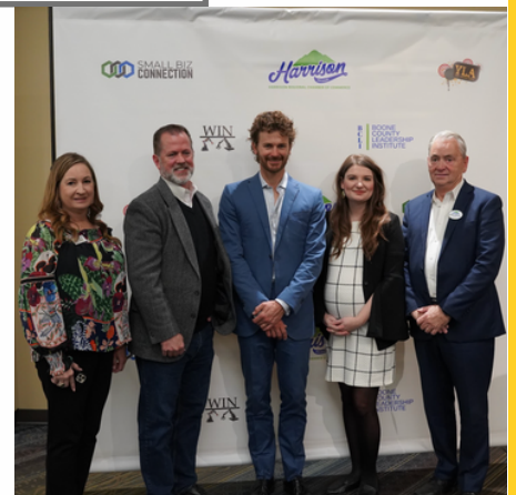
Harrison Economic Development Summit