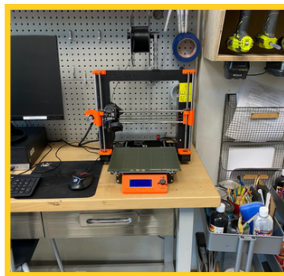
All new 3D printers