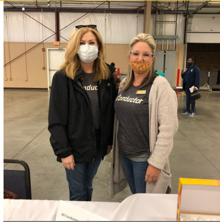
Girl Scouts Expo